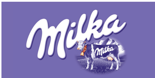
Logo with Milka cow